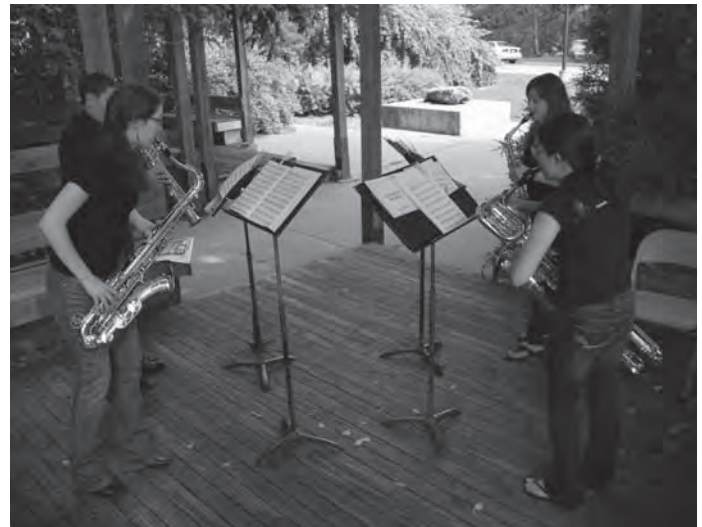
A saxophone quartet from the School of Music’s Chamber Music Institute performs at the Maxwell Arboretum during Meadowlark Invasion! on June 11.