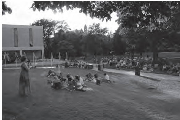
Meadowlark concert outside Kimball Recital Hall in 2010.

Expansion is a relatively new objective for the festival, which is currently in the process of