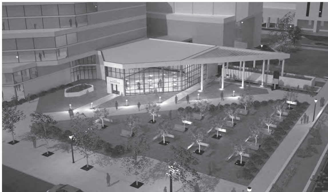
An architect's drawing of what the new Lied Center's "Lied Commons" expansion will look like.