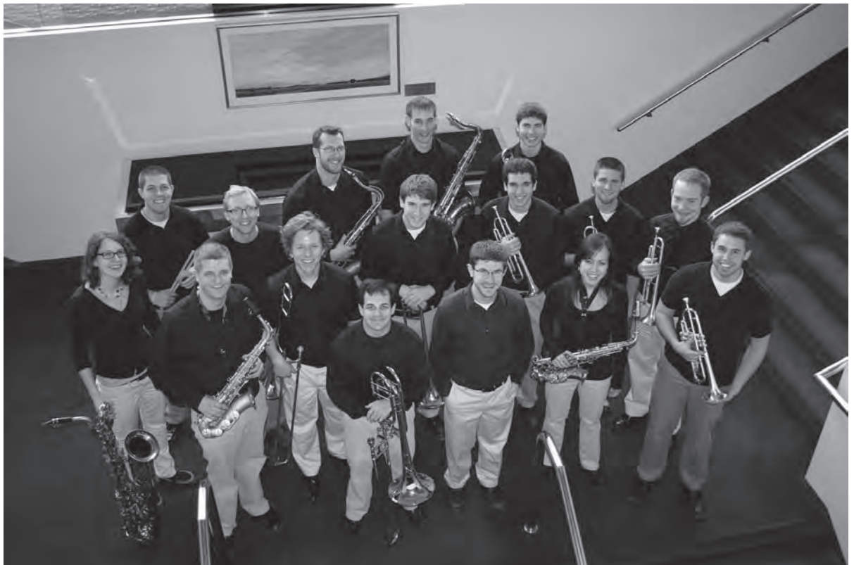
Jazz Ensemble I.