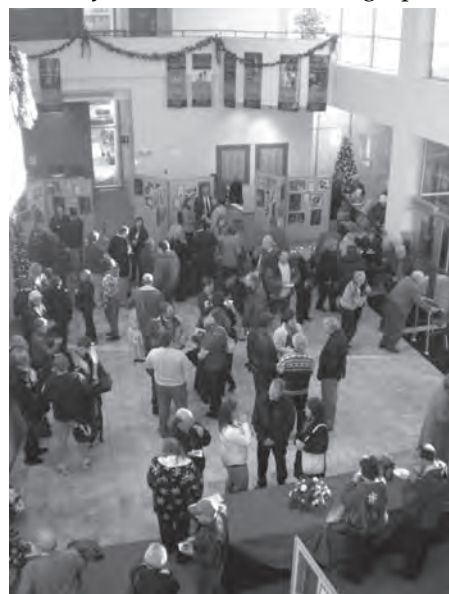
A post-performance reception was held in the lobby of the Tassel Theatre.